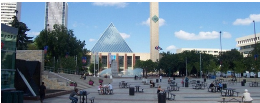
The Winston Churchill Square in Edmonton, Alberta, Canada